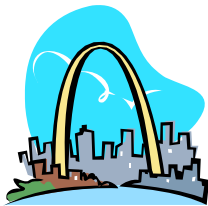
St. Louis, Missouri

The families of the congregation of Redeemer have an exciting opportunity to participate in a Summer Mission Trip to St. Louis, Missouri on July 26th through August 2nd of this year.