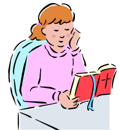
in them we hear God talking with us

In a word, this scared word is the beautiful day-star that gives the pleasant dawn, until the Sun himself arises and shines in the sky of glory.