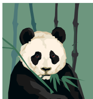
"Who is God?"